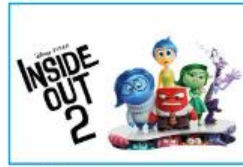
3 - 21 Aug INSIDE OUT 2 (U)