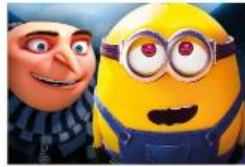
2 Aug - 29 Aug DESPICABLE ME 4 (U)