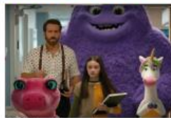
20 July - 1 August IF (U)