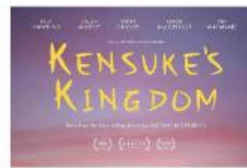
23 - 26 Aug KENSUKE'S KINGDOM (PG) Based on the book by Michael Morpurgo.