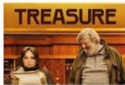
12 - 18 July TREASURE (12A) WITH STEPHEN FRY