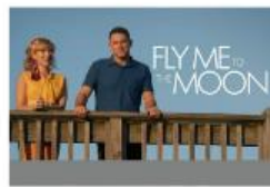
16 - 24 Aug FLY ME TO THE MOON (12A)