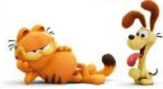
23 July - 31 July GARFIELD (U) THE WORLD-FAMOUS, MONDAY-HATING, LASAGNA-LOVING INDOOR CAT, IS ABOUT TO HAVE A WILD OUTDOOR ADVENTURE!